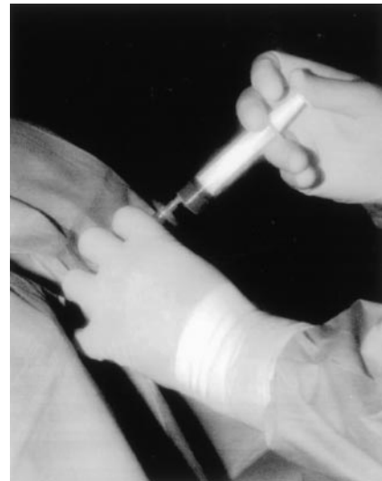
FIG 2. Injection of the oxygen-ozone mixture through a millipore filter.

Selection criteria for oxygen-ozone therapy were the following. Clinical criterion was low back pain resistant to conserva-