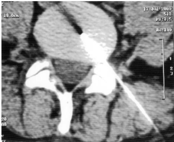
FIG 1. Puncture at L4-L5 performed under CT guidance.

patients with oxygen-ozone therapy and compared the outcome in patients receiving medical ozone alone with that in patients who also received a corticosteroid and anesthetic mixture injected at the same session.